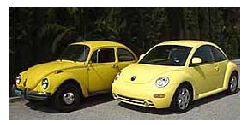
Figure 2: Old and new Volkswagen Beetles

more examples. If they are not of complete cars they are of portions of cars so that something of the heritage of the original comes through to impart its perceived brand value on the present. This could demonstrate post-modernism in action in car design.