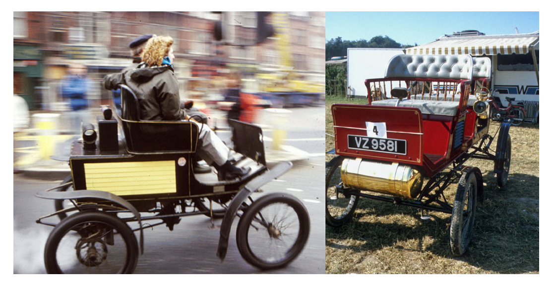
Figure 1 1901 Left: Locomobile, 1901: Right: Likamobile, 1995

Copies of classic cars exist, but they generally have modified features so they can be used more effectively in today's world. The Likamobile, for instance, which is a copy of the 1900 steam-powered Locomobile, is made of largely fireproof materials, has disc brakes for added safety and engine components made of modern materials. But it still steam powered and still looks like a 1900 Locomobile. Likamobiles are not designed for everyday transport, but are an expensive enthusiasts' toy for shows, exhibitions and just for fun.