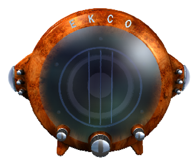
Figure 8: Radio design from a historical perspective

spectrum of life than they were intended to in the first place. They also develop discrimination and discernment.