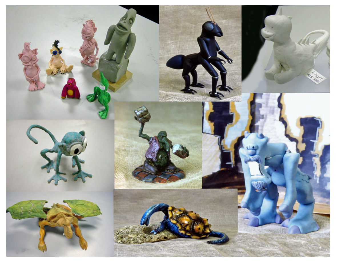
Figure 6: Design an animal. Creative thinking development

The challenge is to transfer this to the students. Although we need to start off by understanding what they get thrilled by and finding out how they tick, it is more fundamental that we reach their hearts and are alongside them as they develop their personal goals and visions. They need to be allowed to dream dreams, to develop their own ways of being. We need to get the students to reach their hearts with their design work and to have our hearts tugged by it. In some cases group visions and thinking will develop.