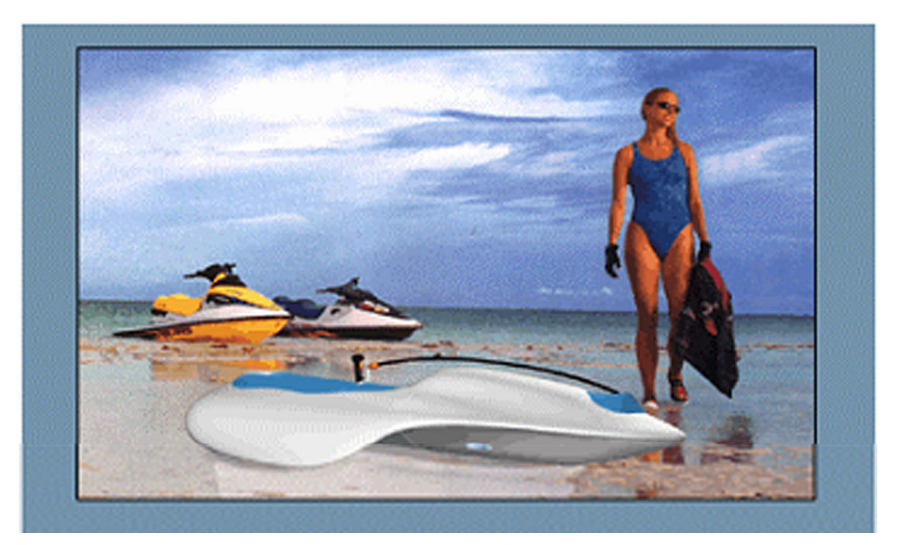
Figure 5: Powered surfboard advertising