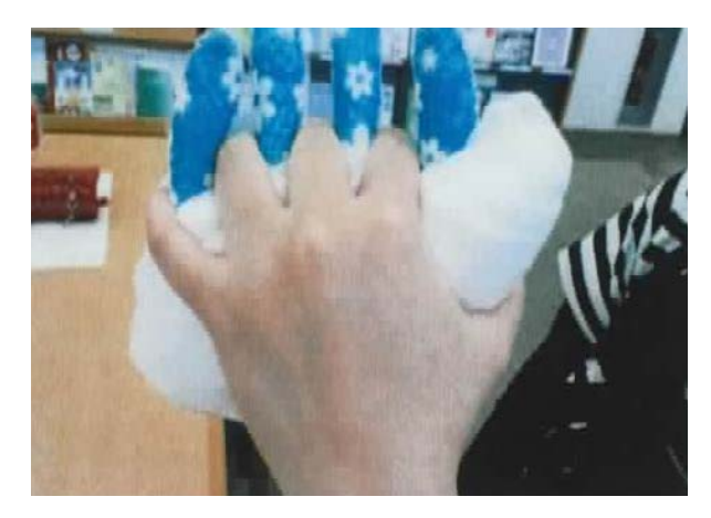
Fig. 2. Rehabilitation tools for the joints of the hand

Furthermore, the students learned the importance of understanding whether they understood the explanations of the patients and observing whether the patients are feeling any pain when undergoing rehabilitation.