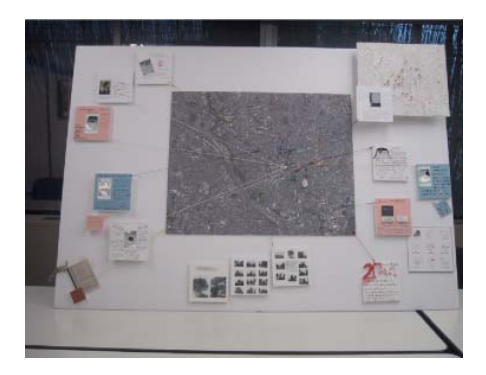
Fig. 1. Spring term 2006

The second workshop was held in the autumn term of 2006. There were seven participants. The style of expression activity was an individual activity involving the arrangement of 8 cards on folding paper, as shown in Figure 2.