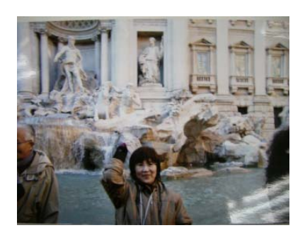
Fig. 11. The Trevi Fountain

- The Trevi Fountain: "I want to go to Rome with my son."