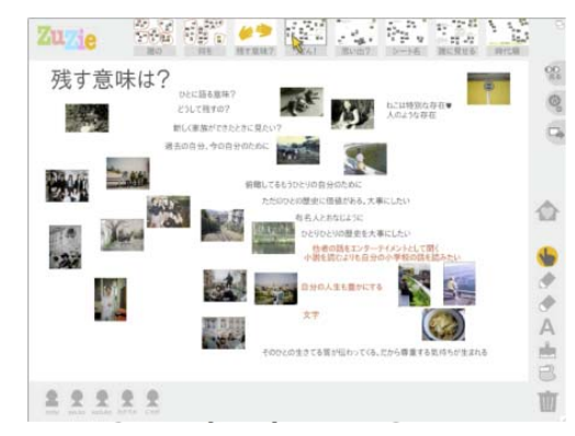
Fig. 8. Why do we record?

What was the purpose of recording the events with photos? The photos were expressions of participants' memories of events; therefore, it is necessary to understand the purpose of wanting to preserve those memories. Personal photos are not normally historically significant like photos in school textbooks. However, we attach a great deal of significance to our personal memories. They enrich our everyday lives, and sometimes personal memories are more interesting than popular fiction.