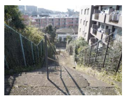
Fig. 12. Steps

S: I recall my father and mother from photos of them walking with their daughter. Because there is no person on the photo.