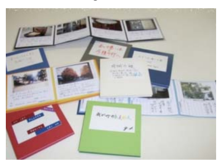
Fig. 2. Autumn term 2006

The second workshop was held in the autumn term of 2006. There were seven participants. The style of expression activity was an individual activity involving the arrangement of 8 cards on folding paper, as shown in Figure 2.