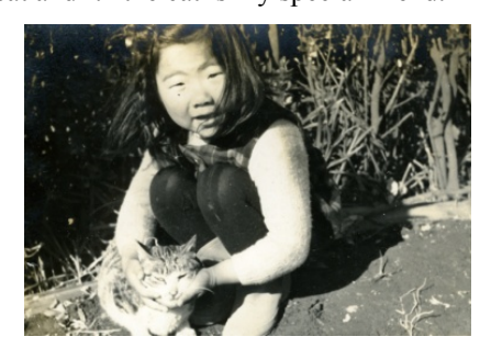
Fig.9. The cat and I

- The cat and I: "the cat is my special friend."