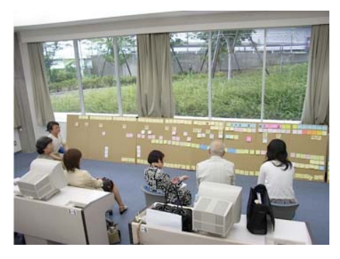
Fig. 3. Spring term 2007

The third workshop was held in the spring term of 2007. There were eight participants. The style of expression activity was a group-based activity where participants prepared cards by indicating their ages and then arranged those cards on solid fiberboard, as shown in Figure 3.