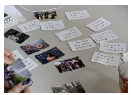
Fig. 4. Spring term 2008

expression activity was individual work involving the preparation of photos and phrase cards. There are some card games that originated in Japan. Participants were instructed to pair photos with phrase cards, as shown in Figure 4.