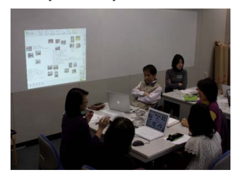
Fig. 5. Mini workshop

The workshops had two things in common: "photos" and "narrations." In order to understand how the participants narrated their memories and showed their photos, we organized a mini-workshop using Zuzie that involved arranging photo cards and phrase cards on sheets and the sheet can be increazed (Yokokawa, 2010). This purpose of this mini-workshop was to find the relationship between "photos" and "narrations."