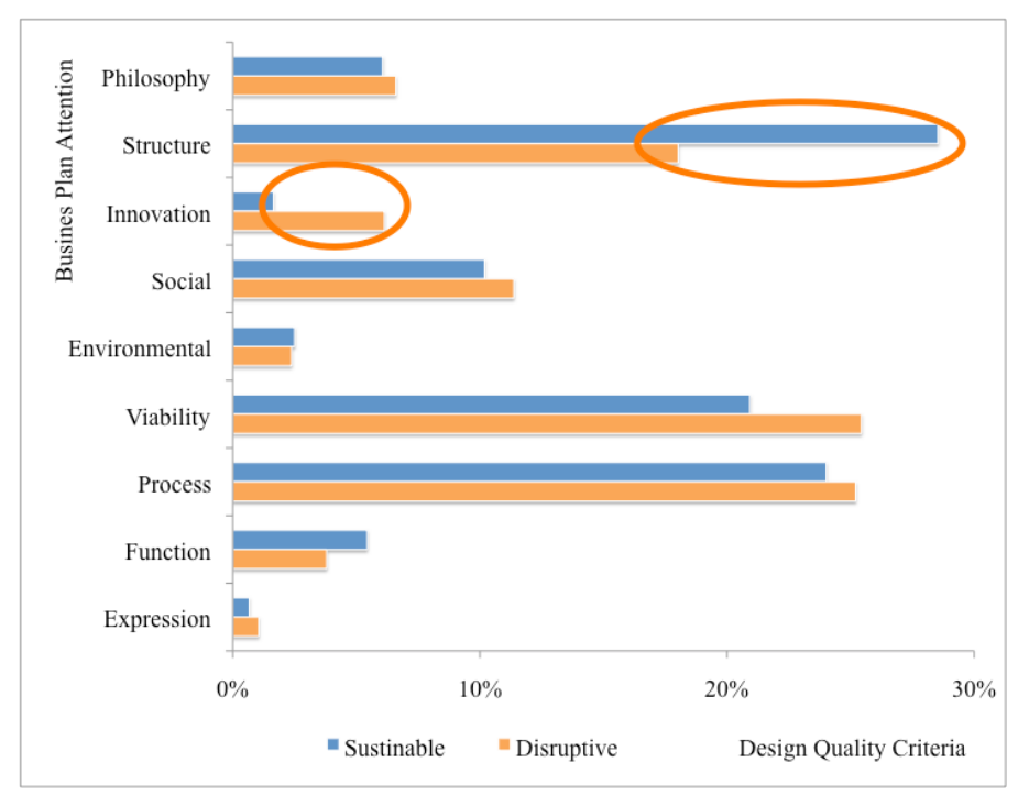
Figure 2. Comparing the distribution of Design Quality Criteria for business plans (n=20), half of which implement sustainable and half of which implement disruptive technologies. Plans for sustainable technologies contain a larger proportion of structure criteria content, while disruptive plans addressing disruptive technologies contain a larger proportion of innovation criteria content (p<0.05 level, SPSS ANOVA F-test).