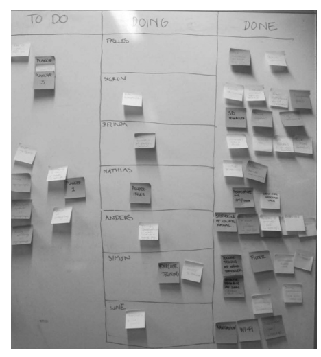
Figure 3. The Scrum board from one of the groups shows broken-down tasks and distribution of responsibility

The groups primarily implement the Daily Scrum meetings and the concept of breaking down tasks into small and manageable tasks, but also the Scrum board, which is often used as a visual planning tool, supporting the Scrum framework, is implemented as a central element in the project management routines. It is observed and to a large extent validated through the interviews that the groups using the Scrum practices are working more efficiently in one common direction and in general seems less stressed by the project. Figure 3 below shows how one of the project groups is using a Scrum board to support their internal communication and task management.