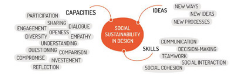
Figure 2 Key skills and capacities for SSD, from McMahon and Bhamra [2].

From these issues identified, SSD often deals with human and societal behaviour, compared to environmental and economic aspects, which have long been thought to be complex and immeasurable [2]. This means that besides more explicit practical design skills (such as idea generation, visual communication, design development, etc.), designers require more collaborative and diverse competencies in terms of transformation and participatory design, socio-entrepreneurship and user-centred design [12]. McMahon and Bhamra [2] suggest a set of skills and capacities that (student) designers require to direct their practice toward social sustainability, as shown in "Figure 2. Key skills and capacities for SSD".