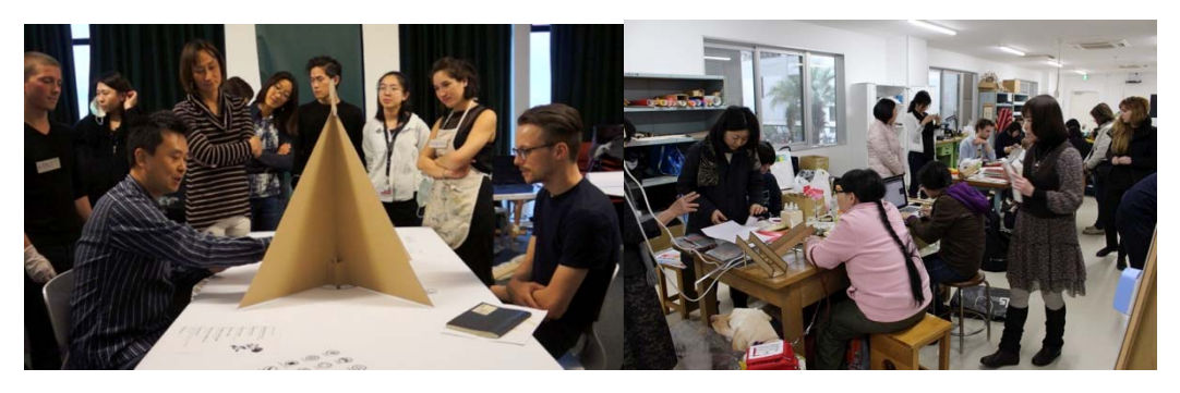
Figure 2. KU and RCA teams working on Re-mix 1 and Re-mix 2