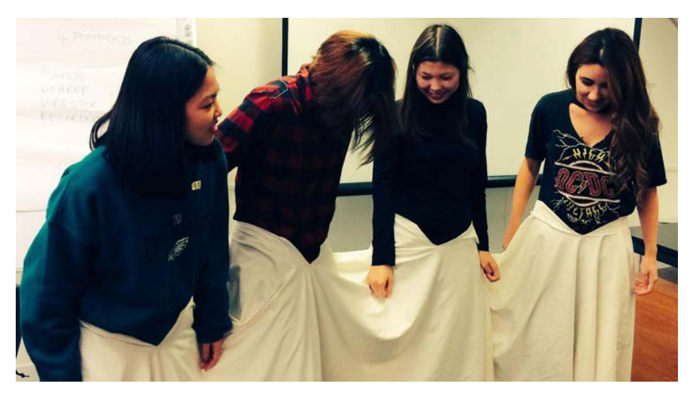
Figure 2. Interdisciplinary teams sharing ideas through the workshop outcome

taken to solve the problem; (3) all groups need to present and discuss the outcomes. In the students' assessment documents I verified how well a method was received and the degree of ownership developed. The active learning helped grow self-criticality, which increased the sense of ownership and the fluency on practicing research. In the assessments students raised questions on the value of adopting methods of design research in the solo project and if these methods could be used otherwise. Hence the workshop worked as an engaged space of collaborative action learning where the discipline per se is less relevant than the discussion and evaluation of the value, role and benefits of research practice methodologies. In one of the sprints we observed that the freedom offered by simple outcomes gave students the opportunity to focus on the process rather than the result, which removed pressure of performance thus adding value to the same process of learning.