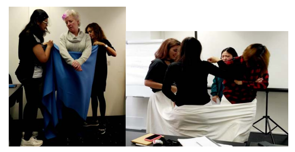
Figure 3. Interdisciplinary teams collaborate in the one of the workshops

the group builds frustration and endemic contrasts embedded in diverse approaches. This aspect is a challenge that could be tackled through transparent leadership based on trust and personal responsibility towards the group.