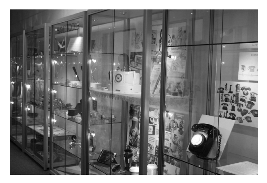
Figure 4. The Displays

The nine finished displays were assessed by a team of tutors and curators from the Museum and by peer assessment in project groups. The six best outcomes were chosen for public exhibition during Degree Show Week (Figure 4). The Us in Museum was marked as a group project, with individual mark variations based on the anonymous peer assessments and the individual Literature Review.