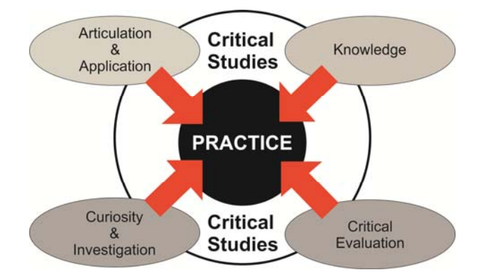
Figure 1. Relationship between Cultural Studies and Design Practice

This paper describes a collaboration between the Creative Design programme at UH and St Albans Museum. The project, described below, explores ways of better engaging design students in the academic strand of the course. One approach is to find fresh ways of addressing theoretical aspects of study by taking the work out of the lecture room and exploring the same concepts through practical activity, which utilise the analytical processes taught in the classroom. Intrinsically linked to this approach is the perceived need to engage all students in a reflective process of design in which theoretical, social, cultural and historical aspects are embedded in studio practice (Figure 1).