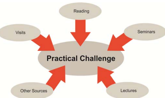
3 THE PROJECT